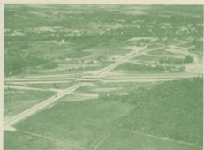
Twin bridges carry I-90-94 over Highway 82 at interchange serving Mauston, in background.