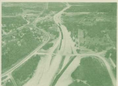
I-90-94 sweeps over County Trunk Highway "C" at interchange serving Camp Douglas, at left, and Camp Williams, at right.