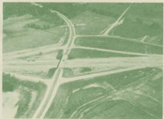
Highway 80 overpasses I-90-94 at interchange between Necedah and New Lisbon, just out of sight beyond curve.