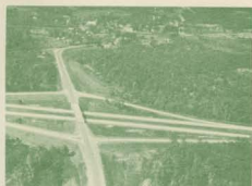
County Trunk Highway "HH" overpasses I-90-94 at interchange serving Lyndon Station, in background.

Dedication programs will be presented by officials and citizens of the above named communities together with the area communities of Wisconsin Dells, Elroy, Union Center, Necedah, Hustler, Kendall, Wilton, Norwalk, Sparta and Black River Falls... and the nearby towns of Lyndon, Seven Mile Creek, Kildare, Wonewoc, Summit, Plymouth, Lindina, Lemonweir, Marion, Fountain, Lisbon, Germantown, Orange, Clearfield, Cutler, Necedah, Clifton, Oakdale, Byron, Wilton, Tomah, La Grange, Ridgeville, Adrian and Greenfield... and the Castle Rock-Pentwell Flowage areas... all in Juneau and Monroe counties.