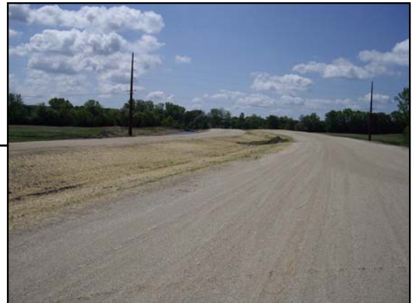
Bypass mainline north of Fox River Crossing near WIS 36/83