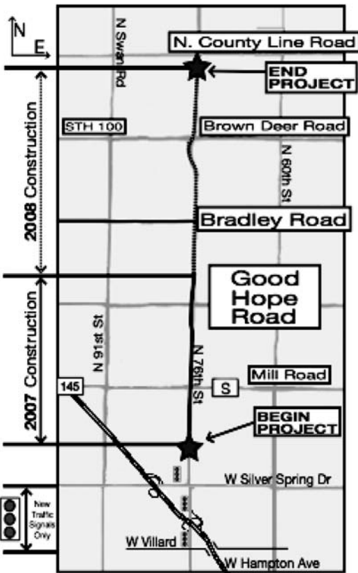
North 76 th Street project map